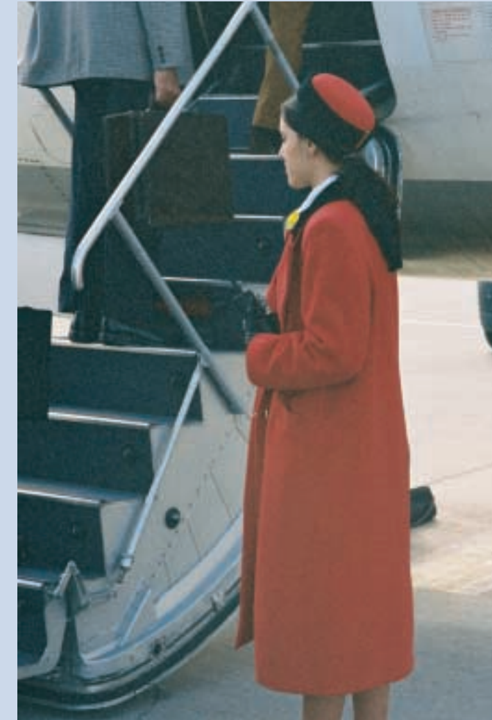
Stephen Waddell, Boarding , color photograph (56 x 37 in.), 1999.

Waddell's photographs are usually taken surreptitiously in public places.